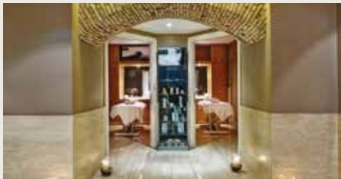
St. George Spa - treatments

This is the sight boasted by the Hotel Indigo Rome - St. George and its Health & Beauty Centre, where the professionalism of the management is focused on a single objective: the sublimation of the senses.