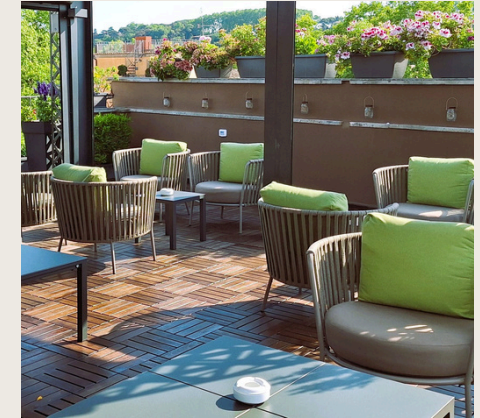
Panoramic Roof Terrace