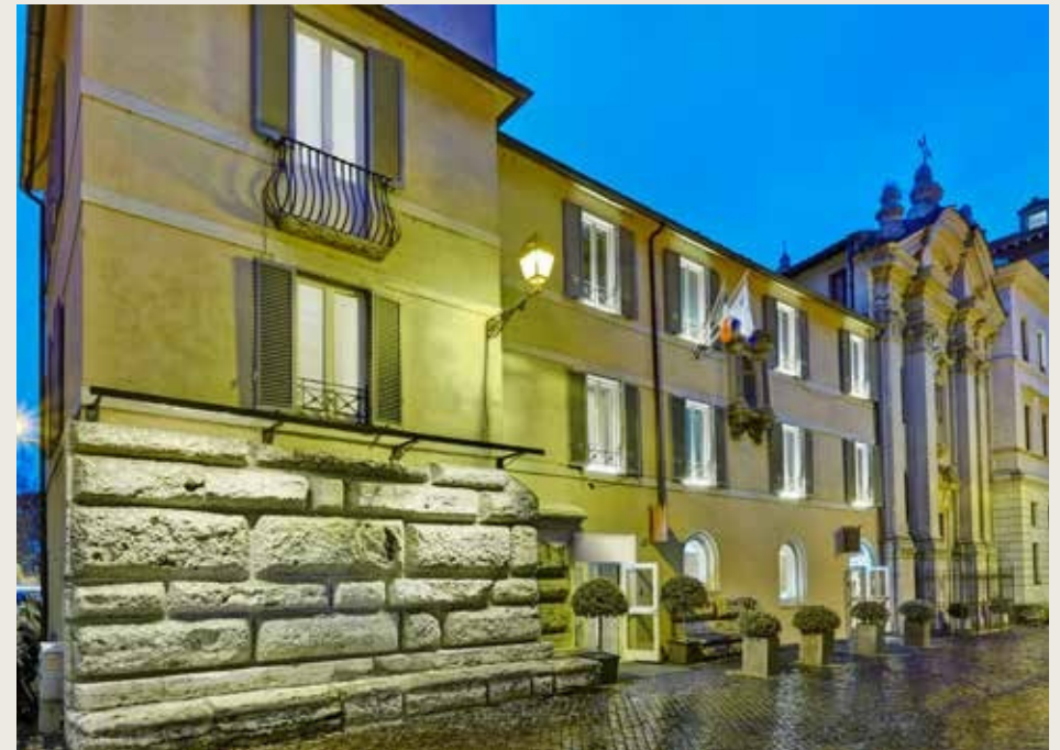
Hotel Exterior by night

He commissioned Donato Bramante, the designer of St. Peter's Basilica, to plan the new thoroughway and to create a centrepiece - the 'Palazzo dei Tribunali' - to be the hub of the city's justice system. This was never finished but the great stone seats, which are all that remain of the courthouse, have been incorporated into the Hotel Indigo Rome - St. George and are affectionately known as the 'Sofas' of Via Giulia.