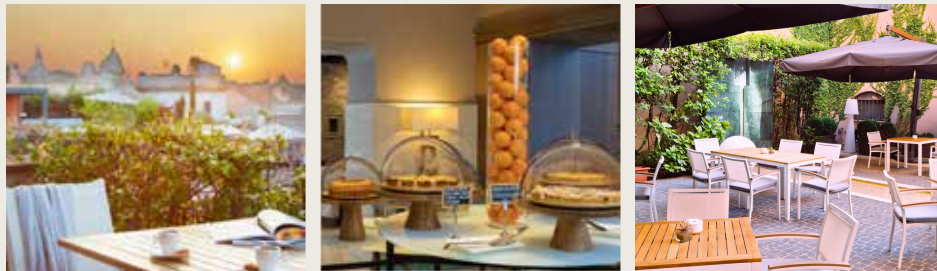
I Sofà Bar Restaurant & Roof Terrace