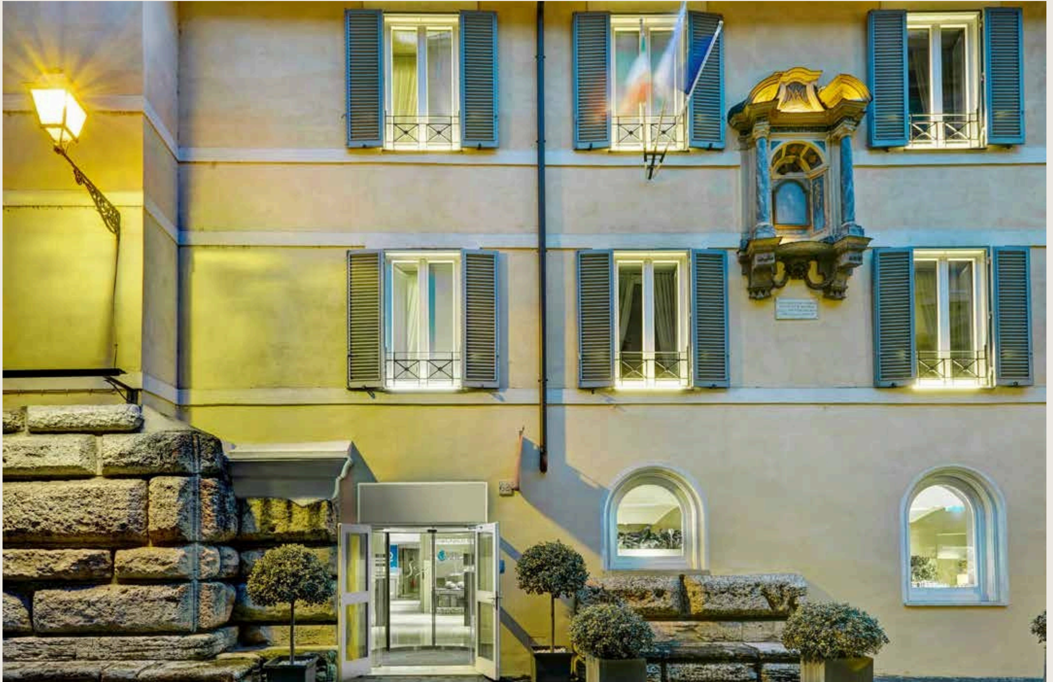
Hotel Exterior by night