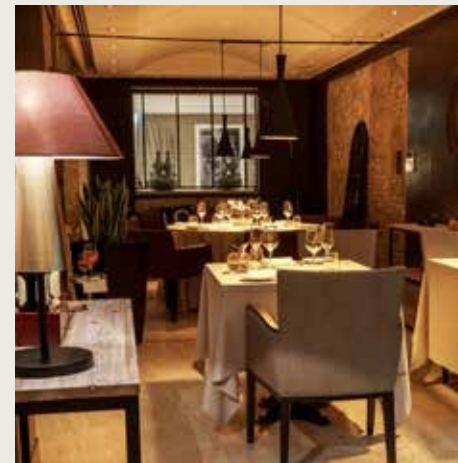
I Sofà Restaurant