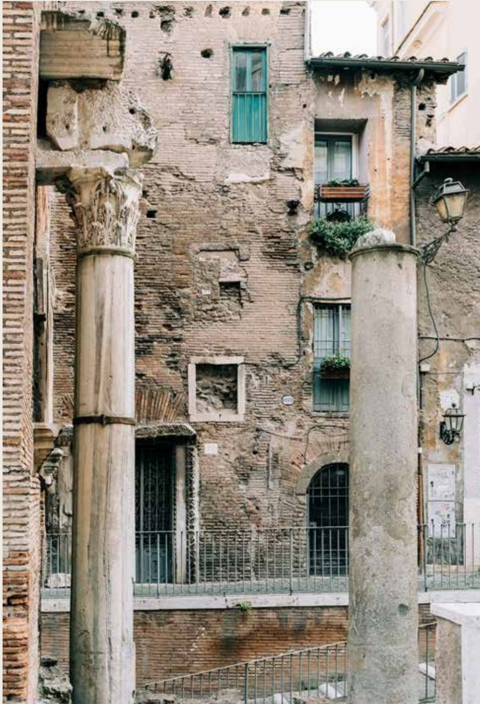
Portico d'Ottavia - Jewish Ghetto