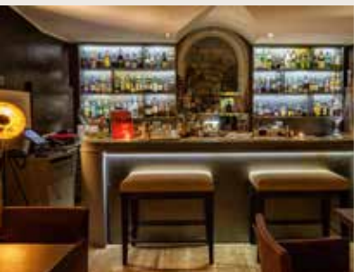
I Sofà Bar