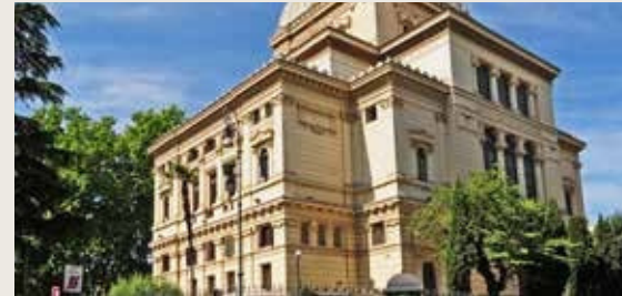
Synagogue of Rome