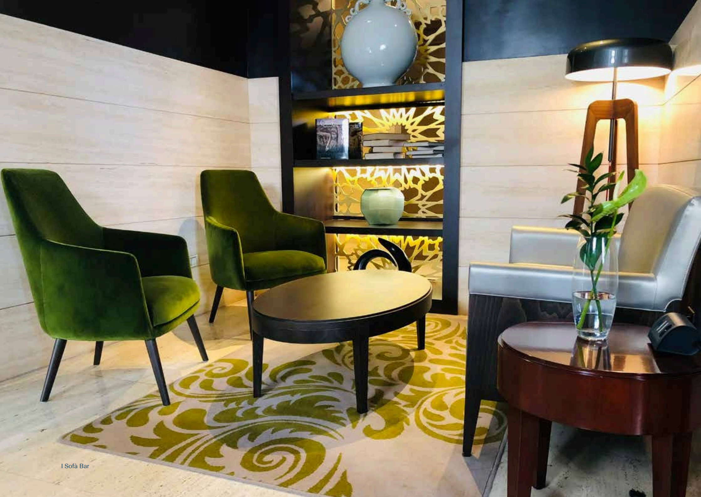
I Sofà Bar