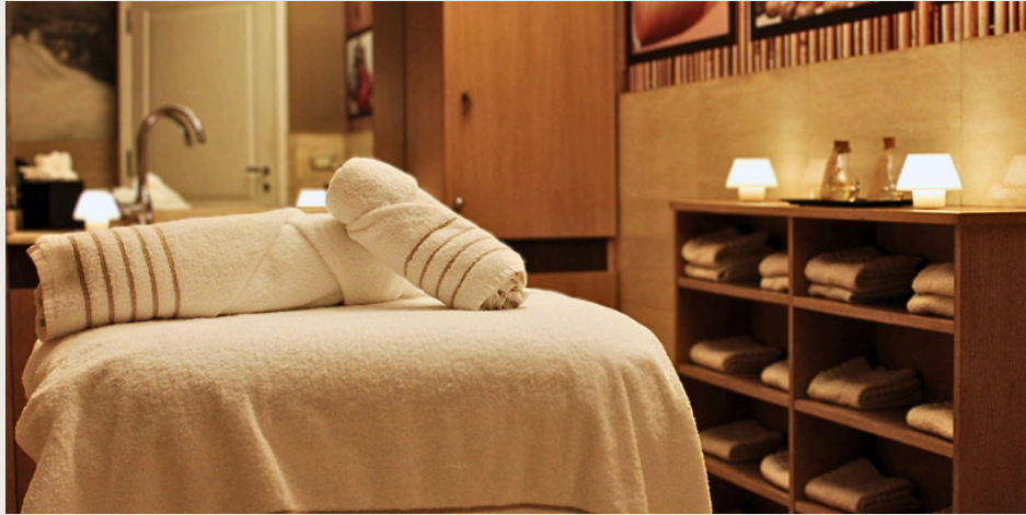
St. George Spa