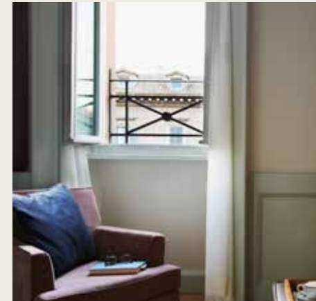
Junior Suite - living